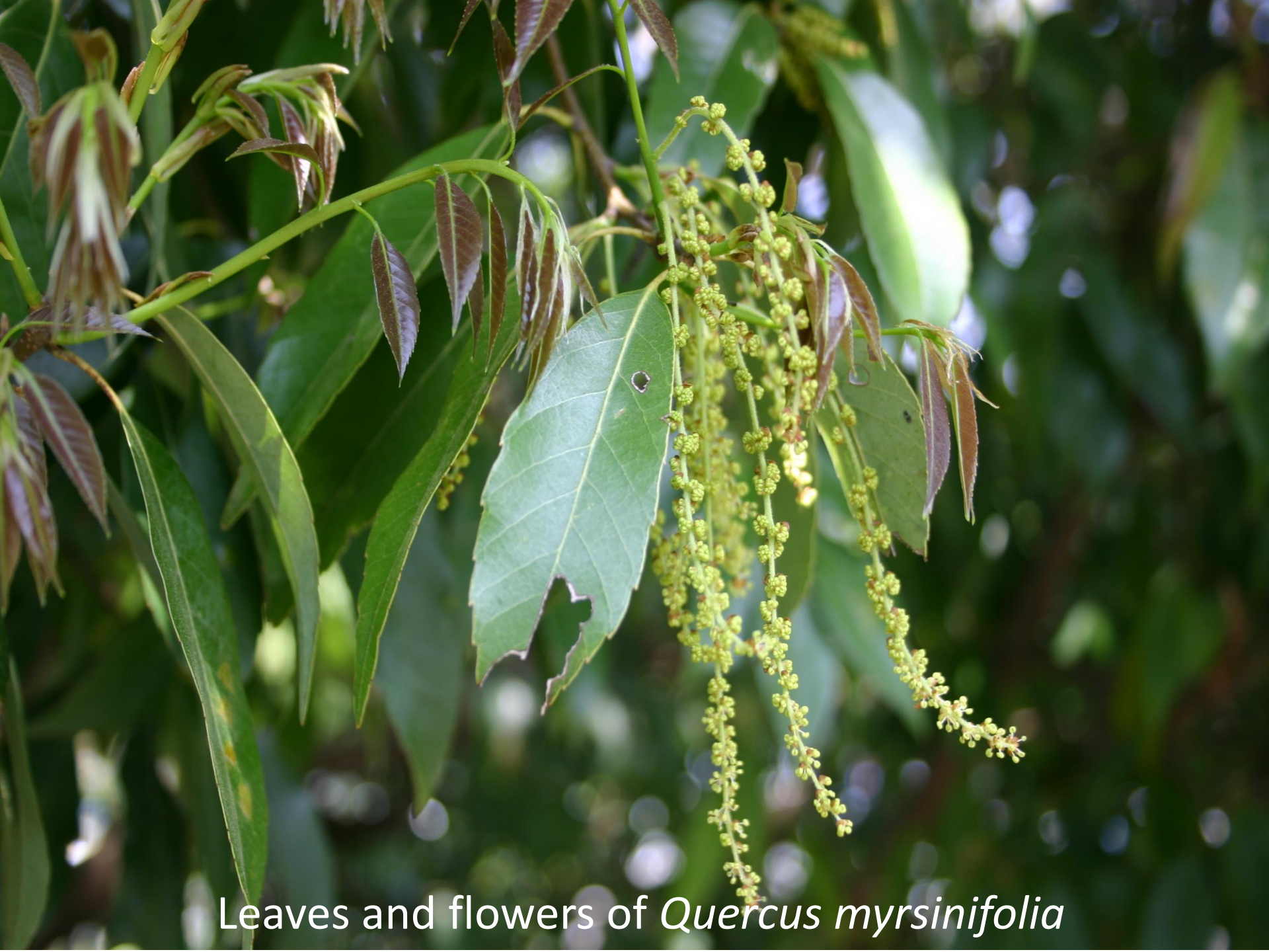
Leaves and flowers of Quercus myrsinifolia