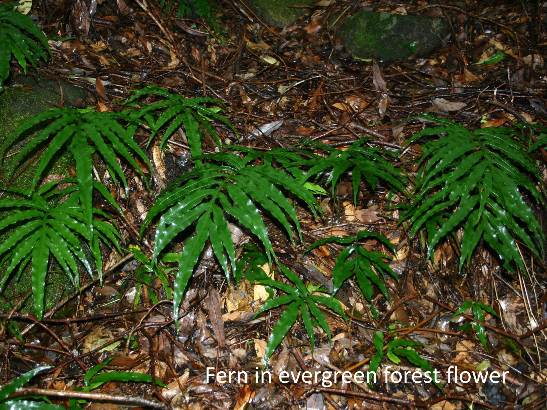
Fern in evergreen forest flower