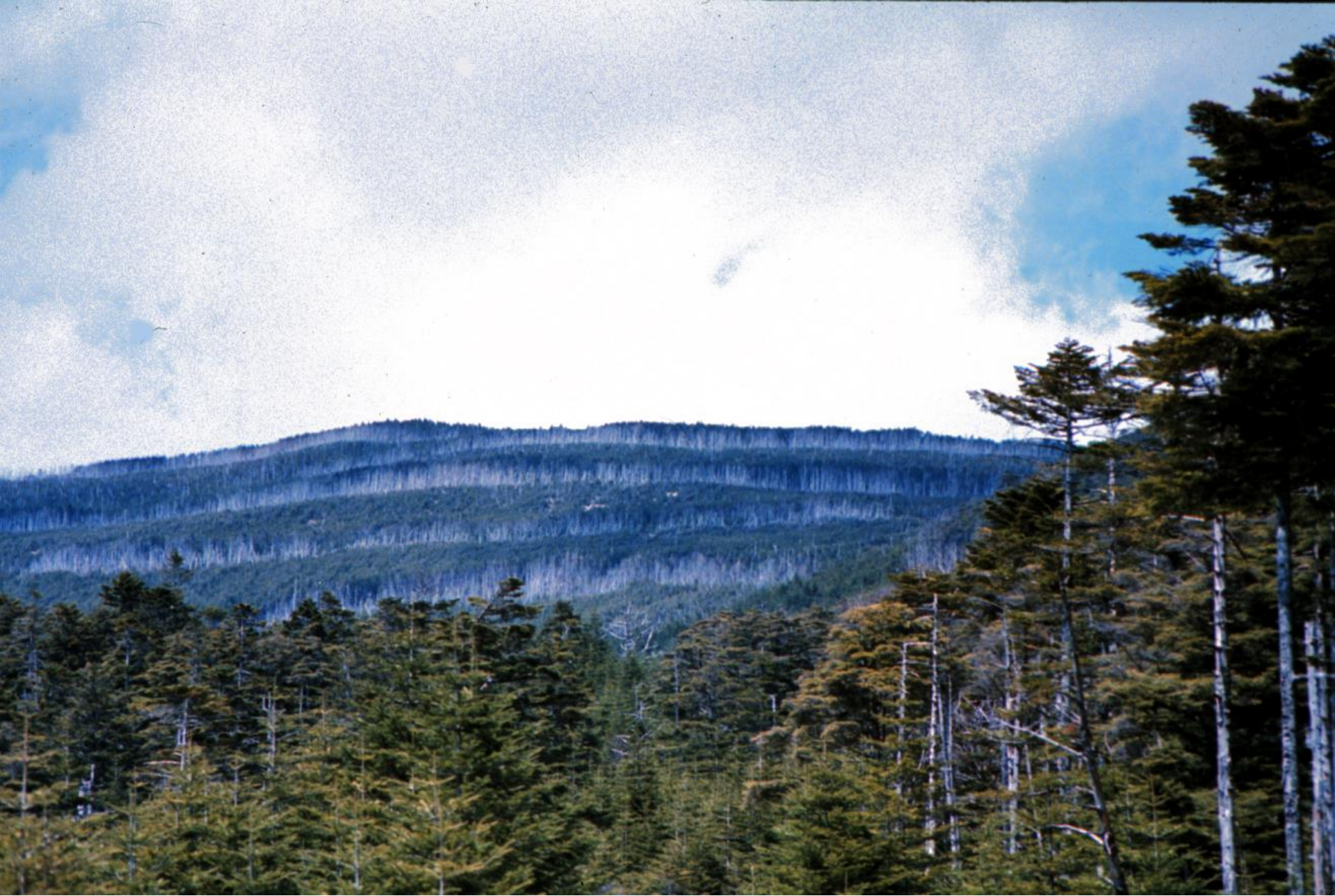
Abies Forest in Subarctic Forest