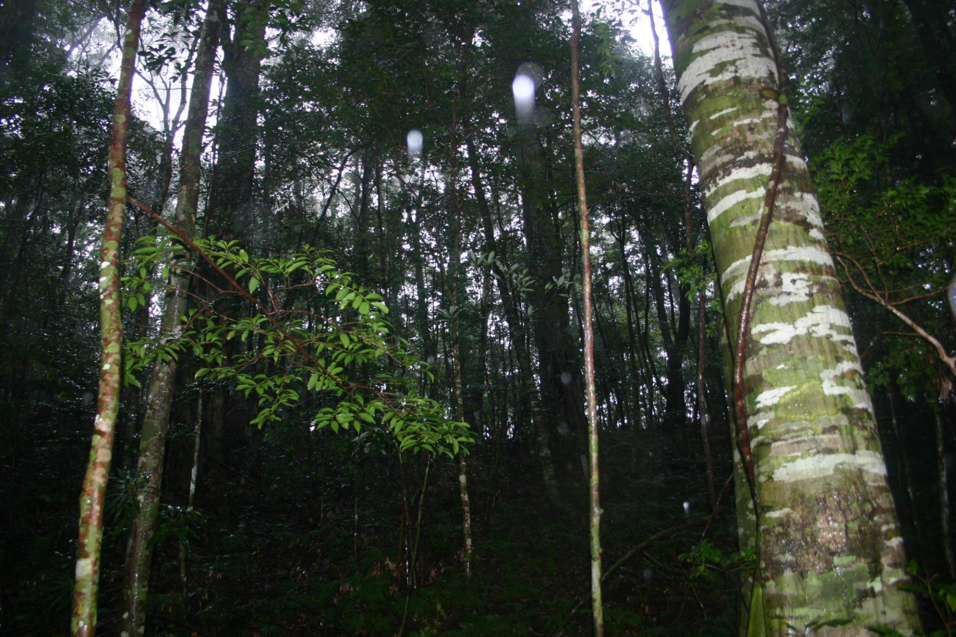
Inside of evergreen forest