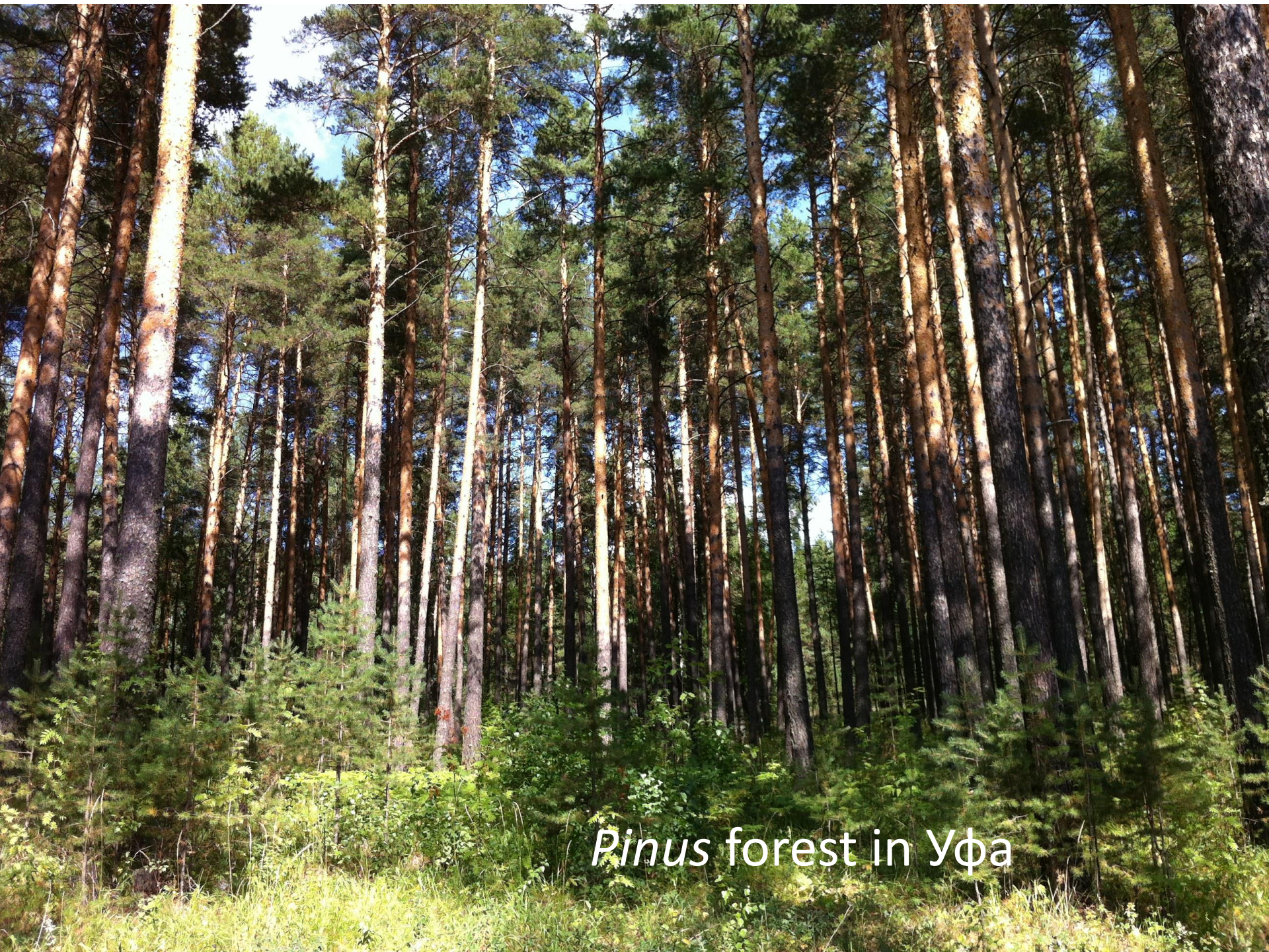
Pinus forest in Υφα