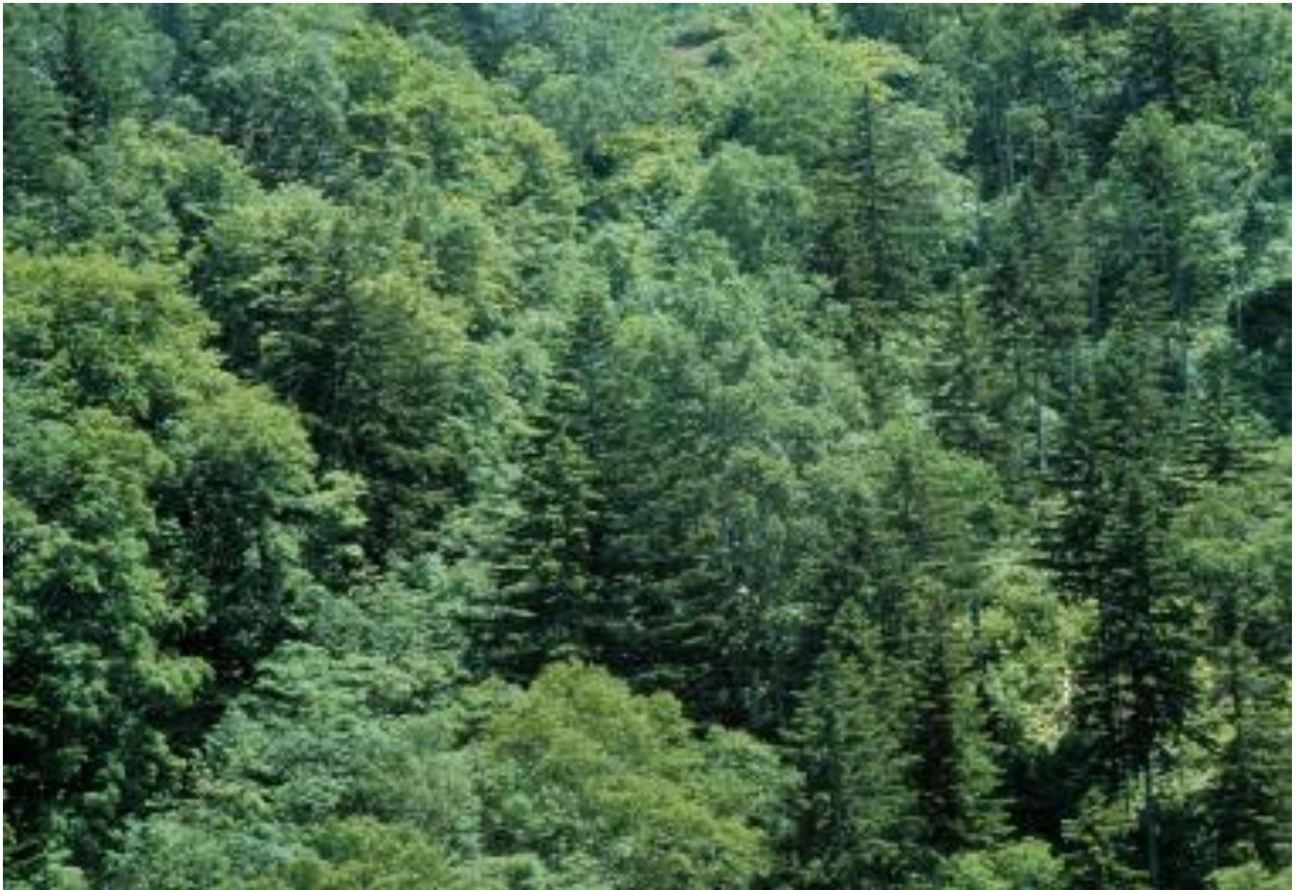
針広混交林 Mix Forest of Coniferous and Broadleaf Tree