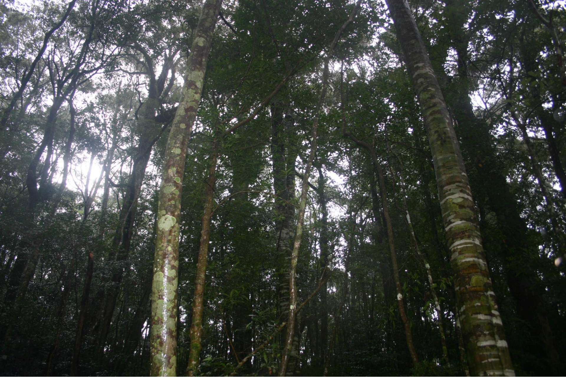
Inside of evergreen forest