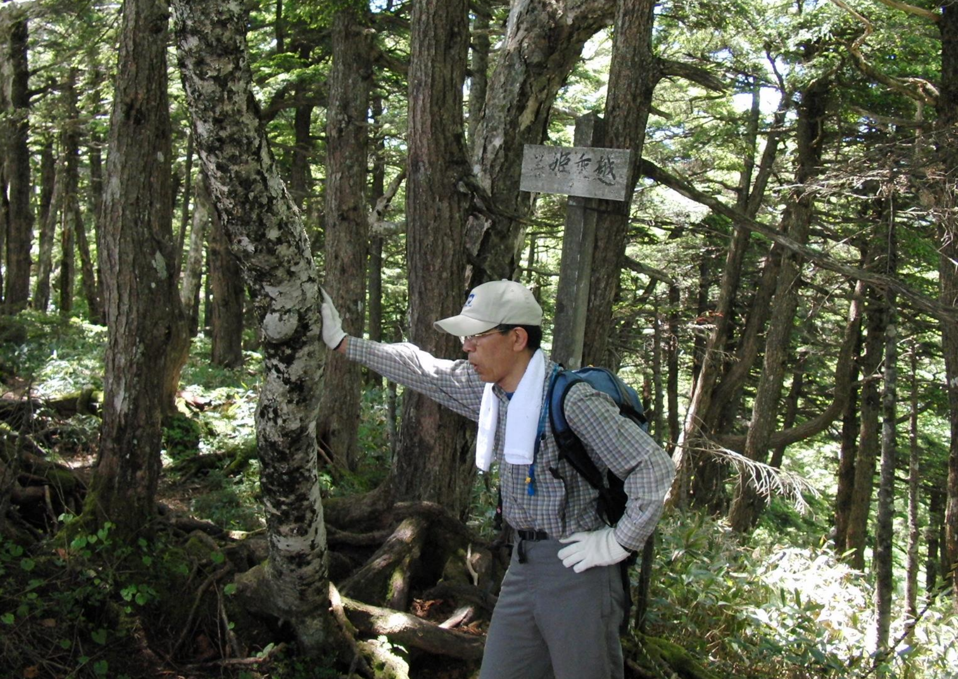
Coniferous forest in subarctic zone