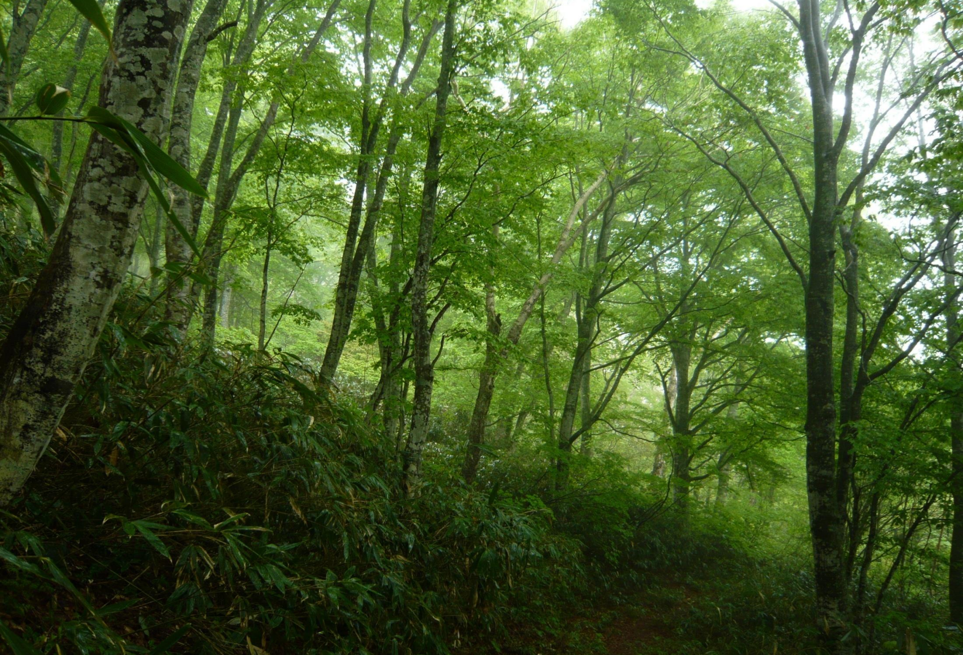
Fagus forest in cool temperate zone in Japan