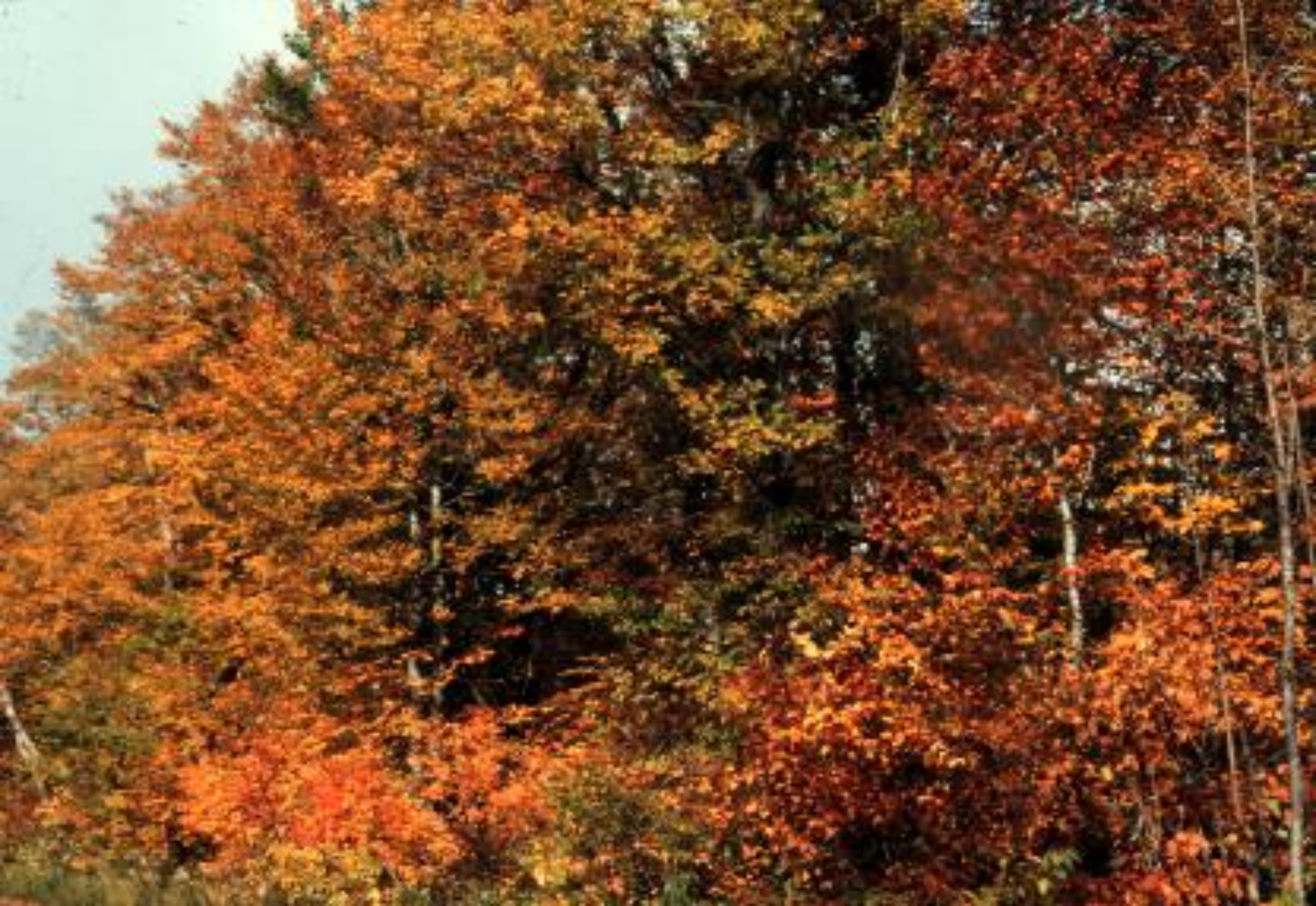
Fagus forest in autumn