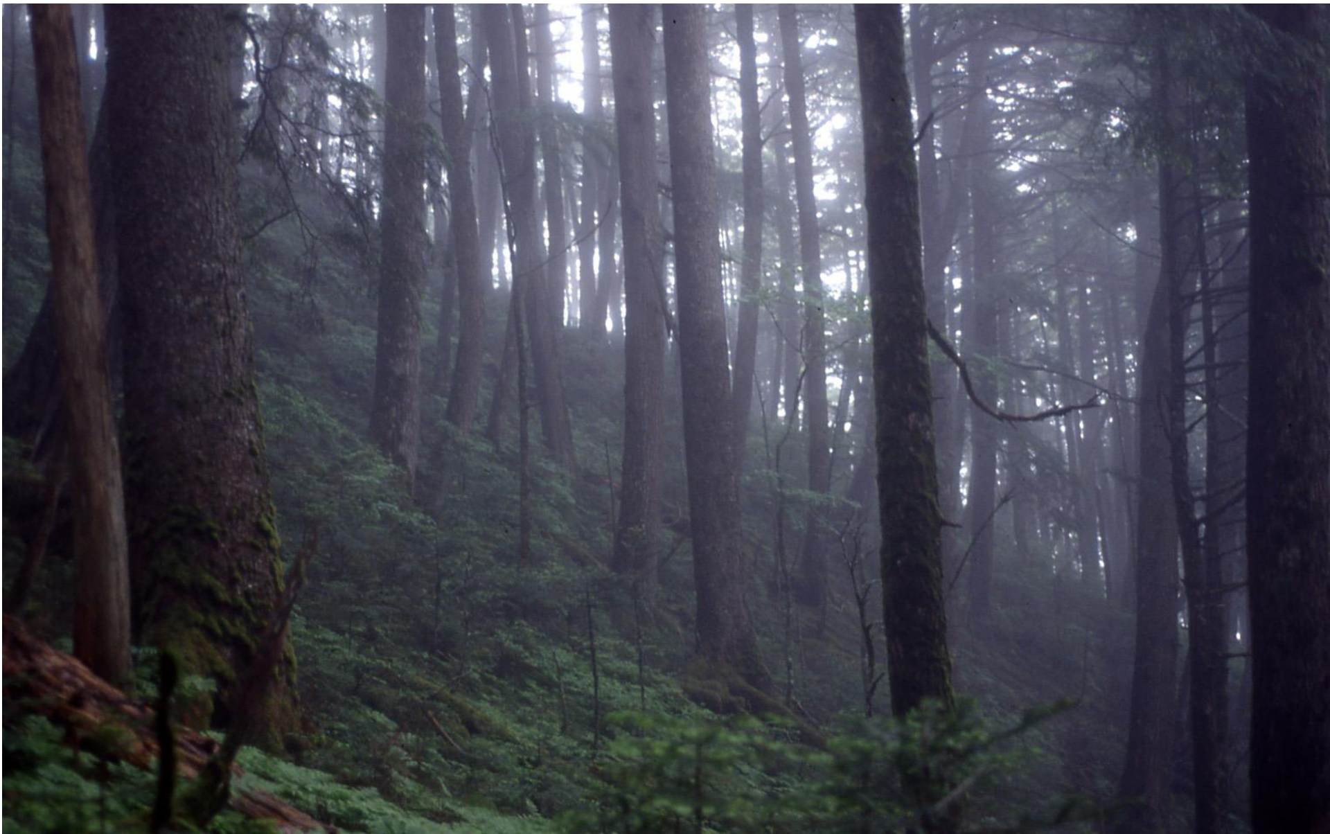
Tsuga forest in subarctic zone, Nagano