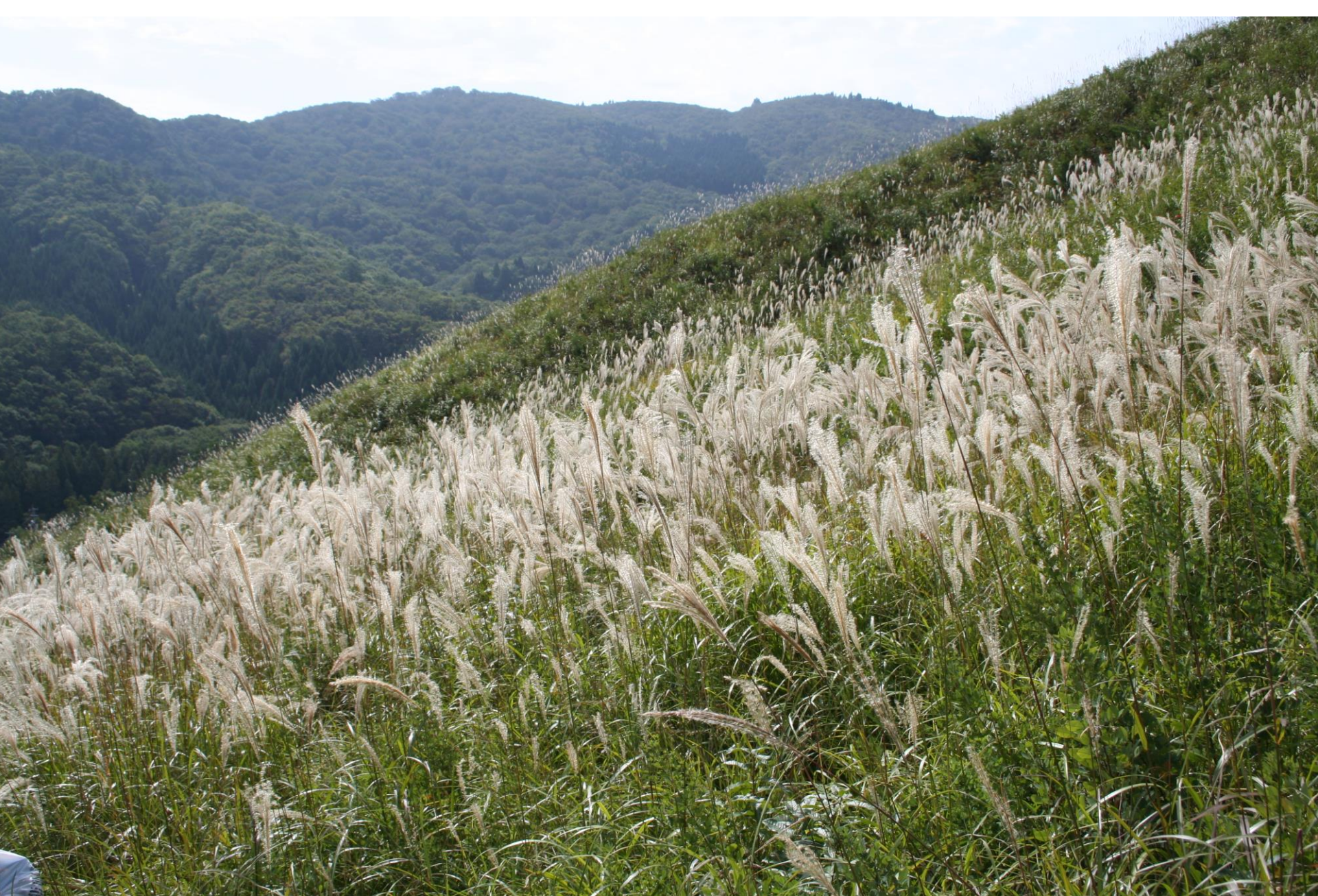
Miscanthus grassland in Japan