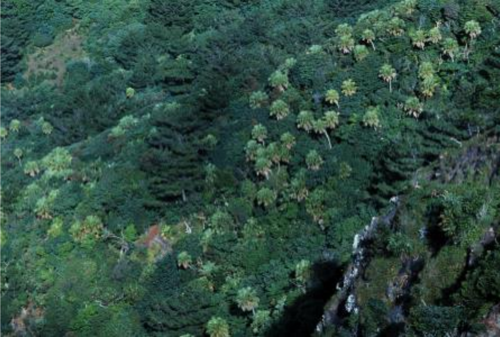
Tree fern in subtropical forest