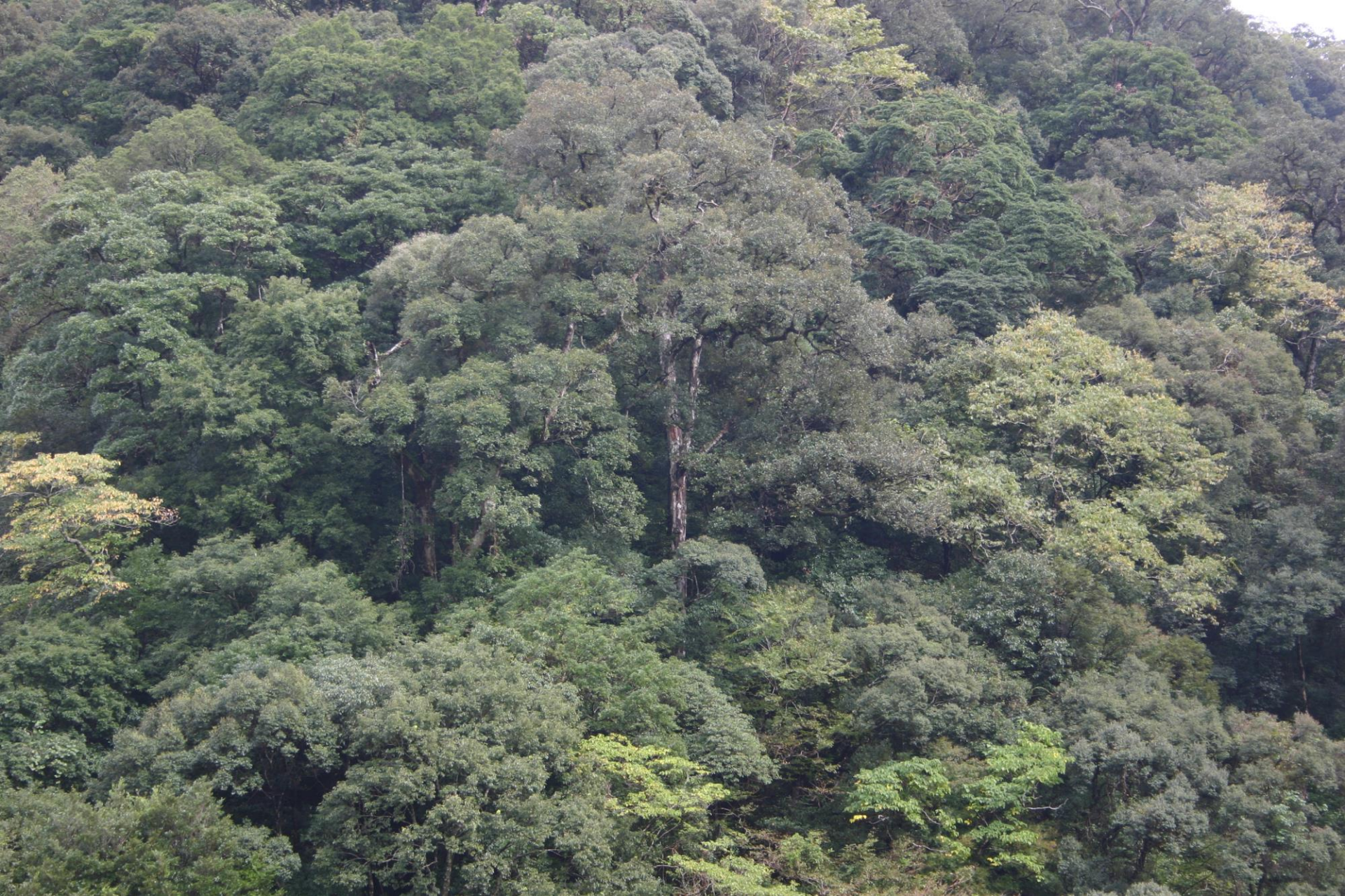
Evergreen forest in Miyazaki