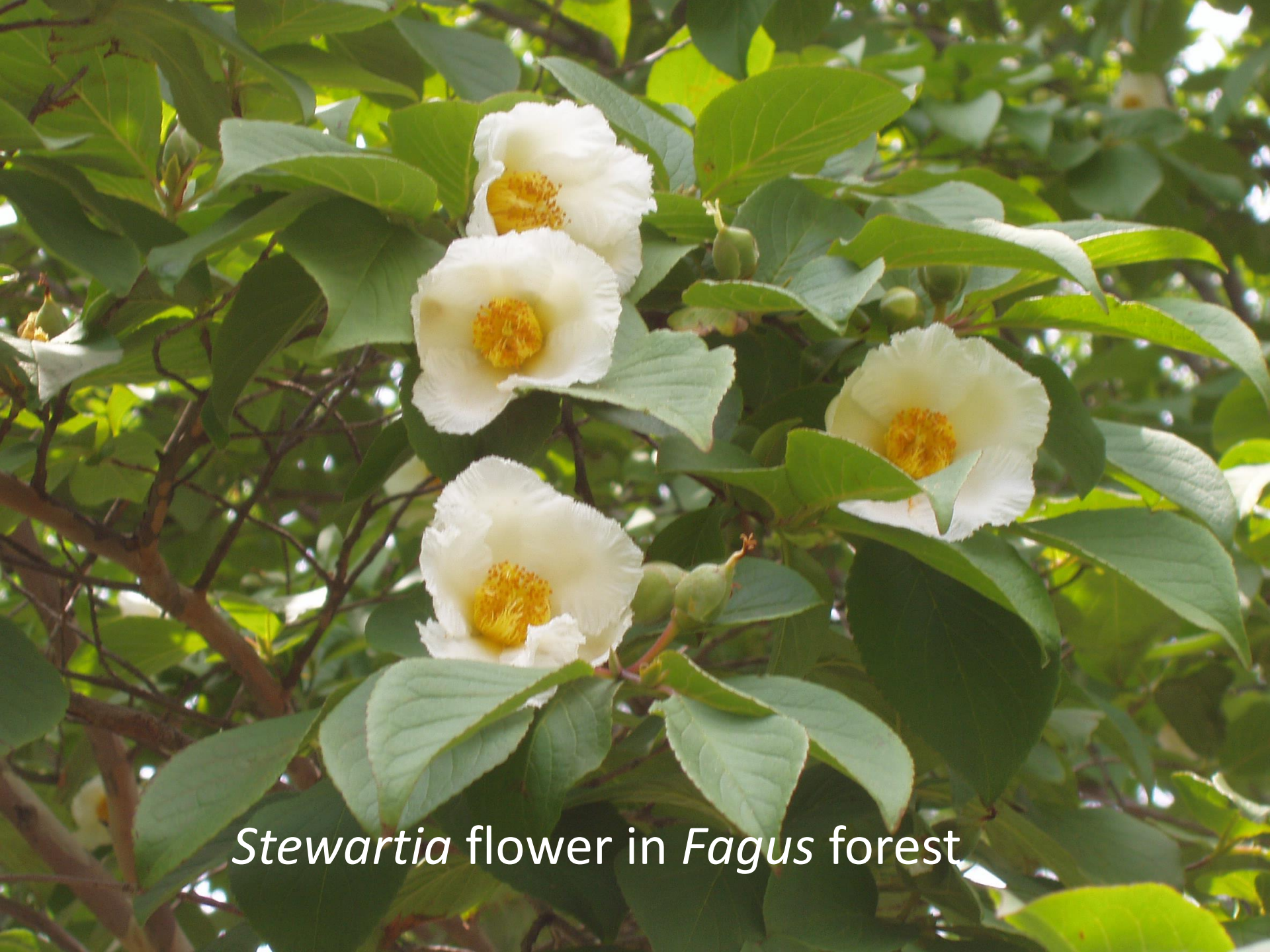
Stewartia flower in Fagus forest