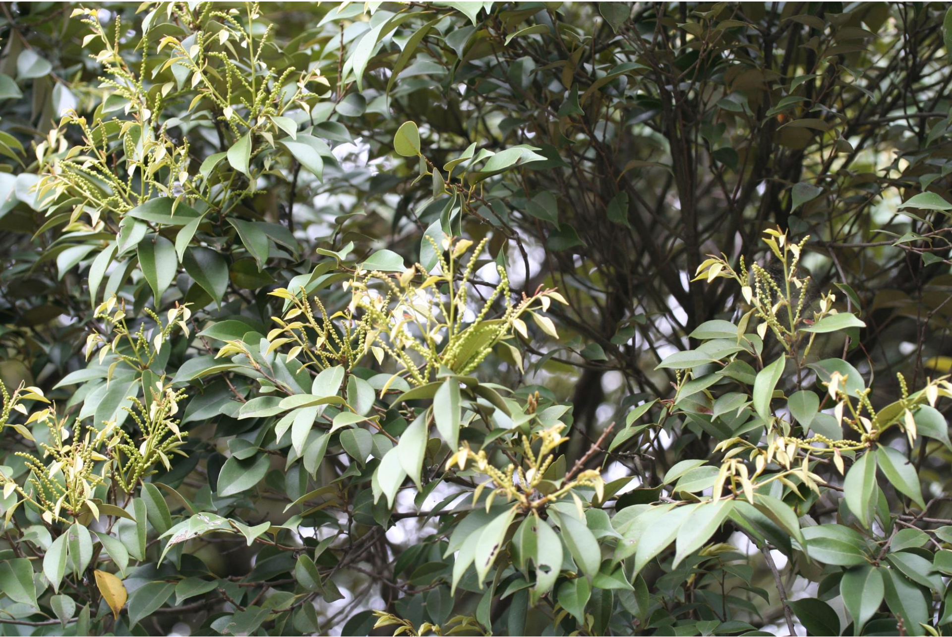
Leaves and flowers of Castanopsis sieboldii