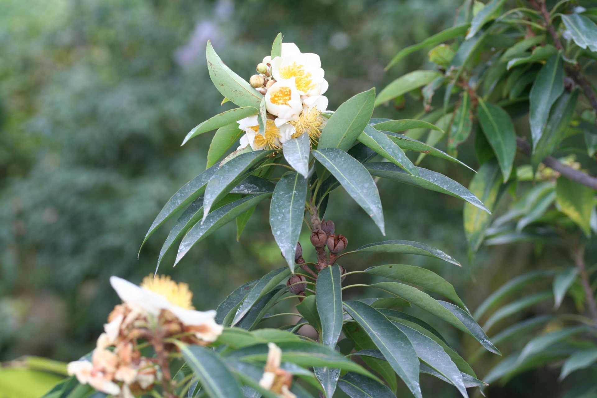
Schima wallichii , Camelliaceae ヒメツバキ