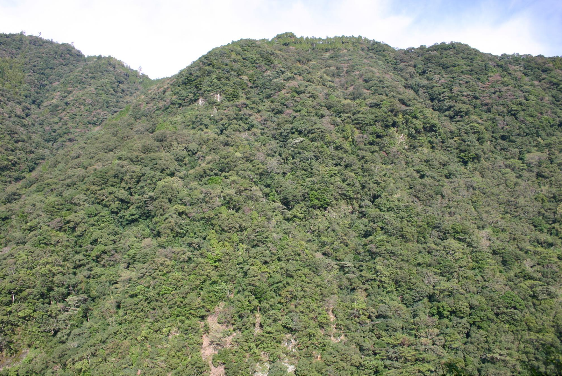
Evergreen forest in Miyazaki