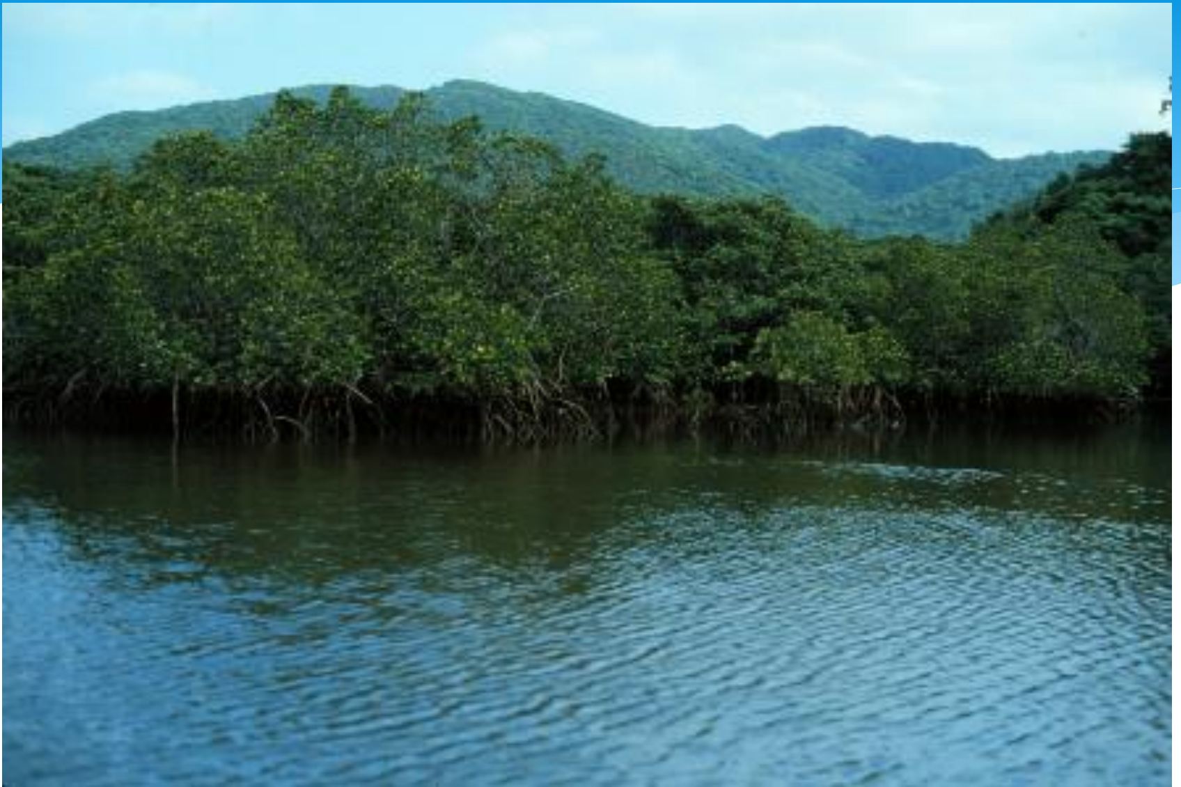
Mangrove in Okinawa