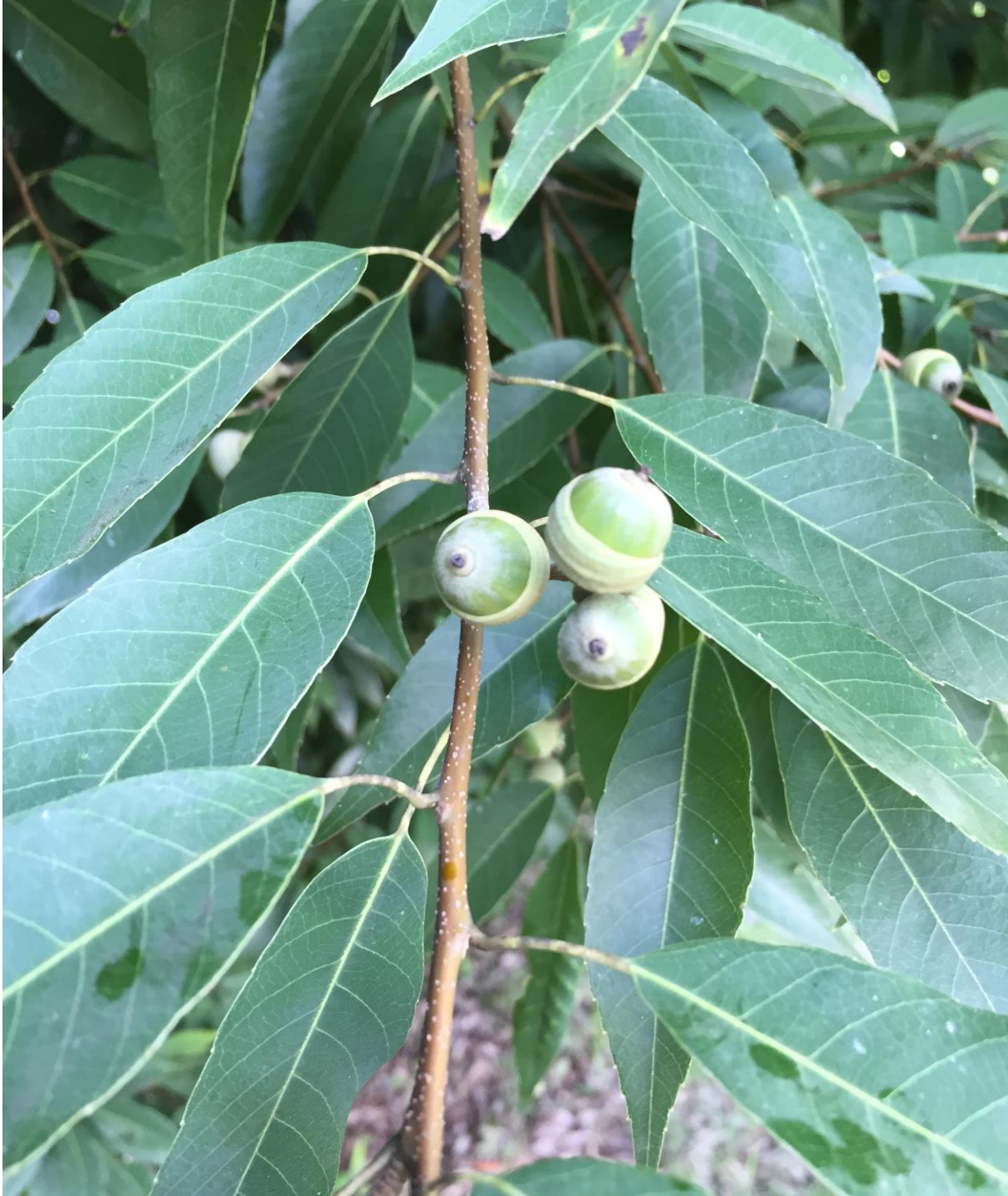
Acorn of Quercus myrsinifolia