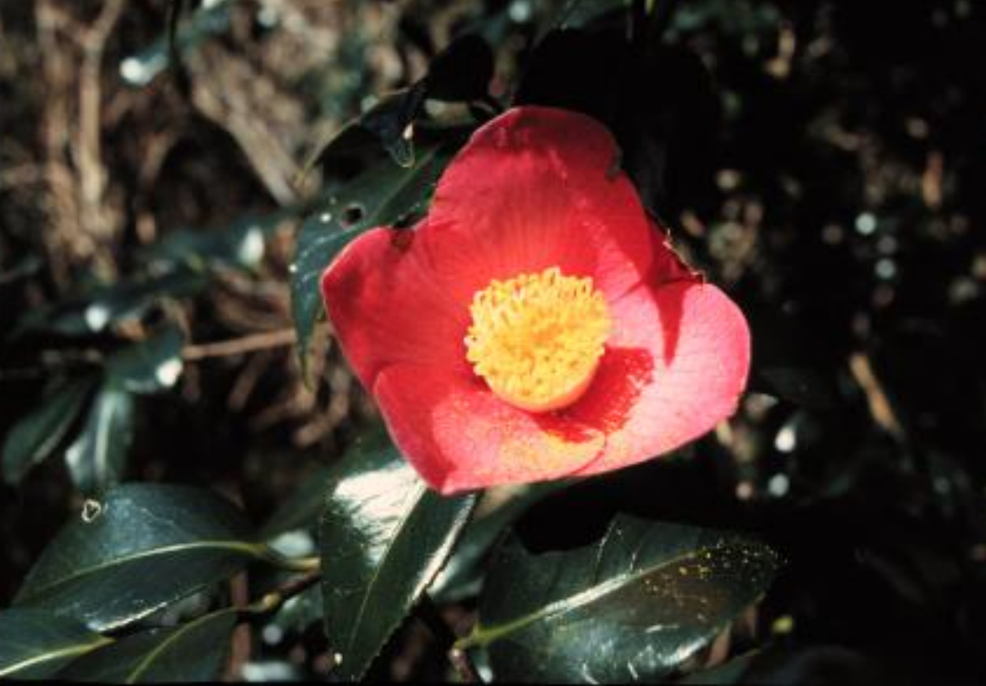
Camellia japonica ヤブツバキ