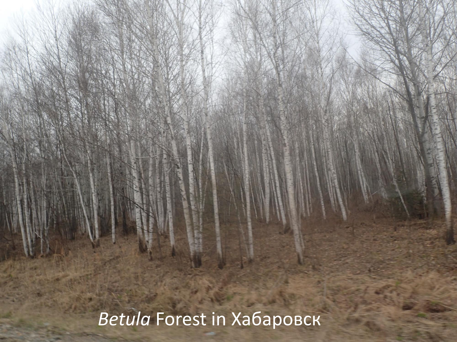
Betula Forest in Хабаровск