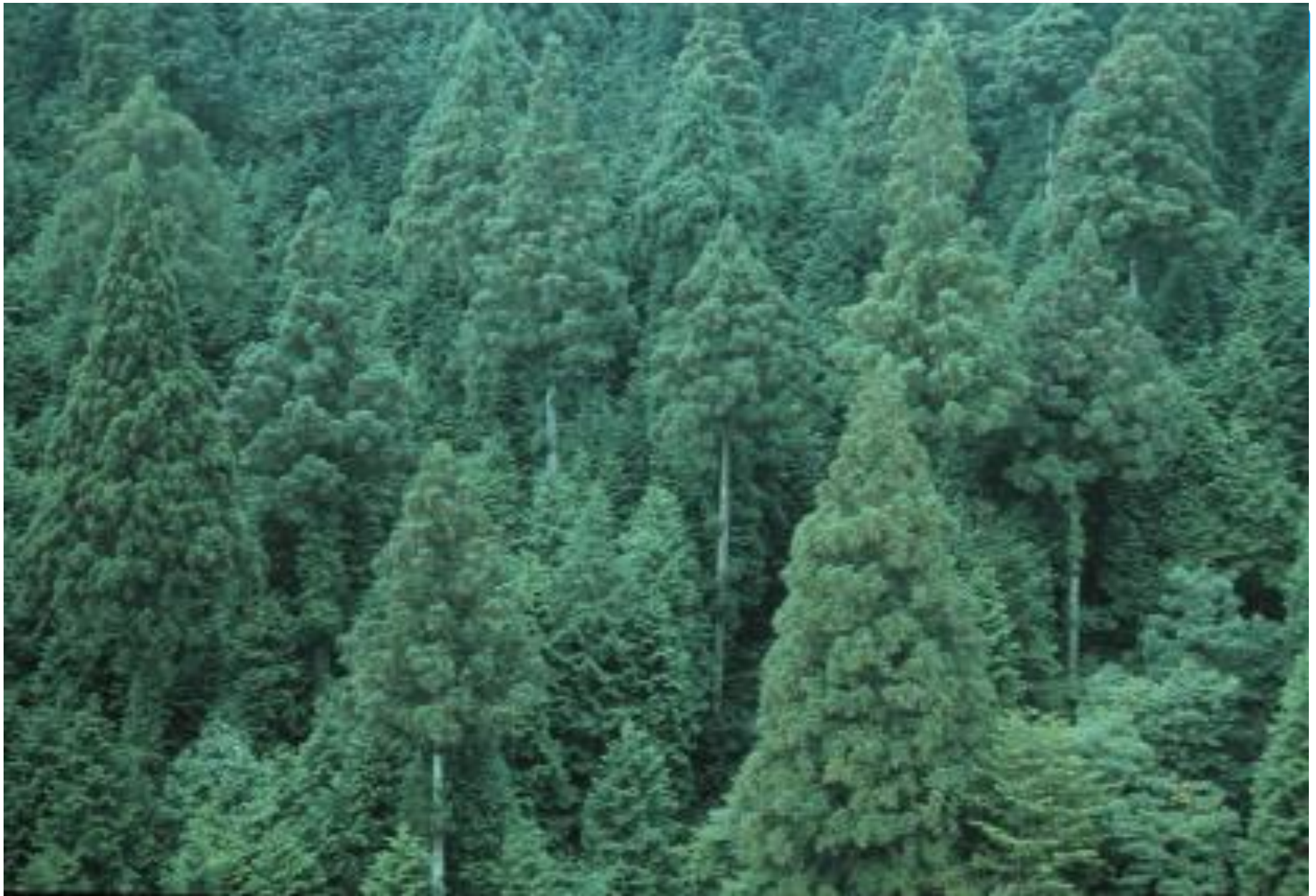
Artificial forest of Cryptomeria japonica