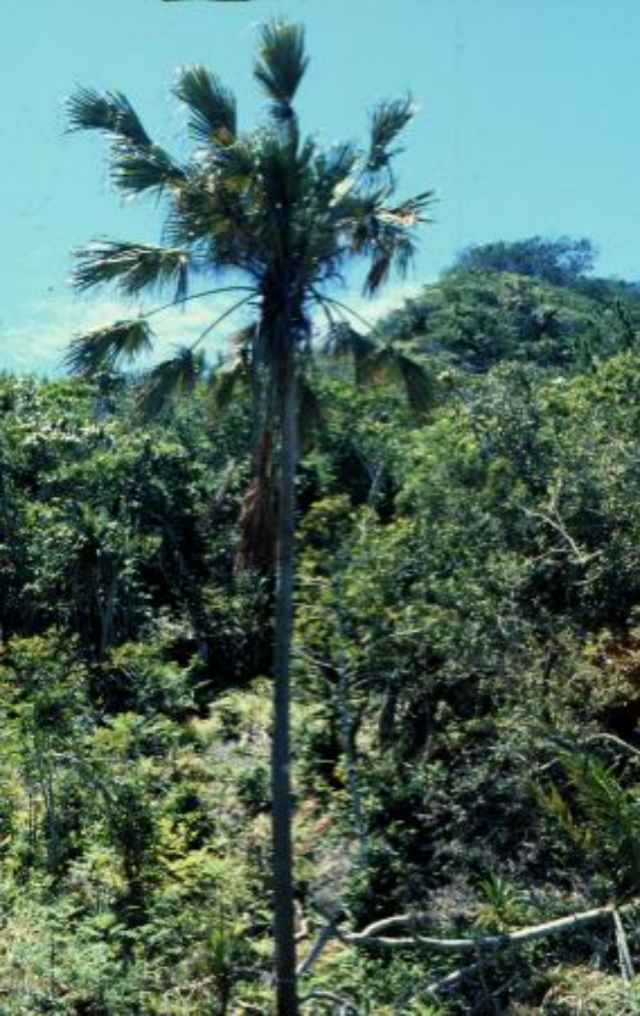
Clinostigma savoryanum in Okinawa セーボレーヤシ