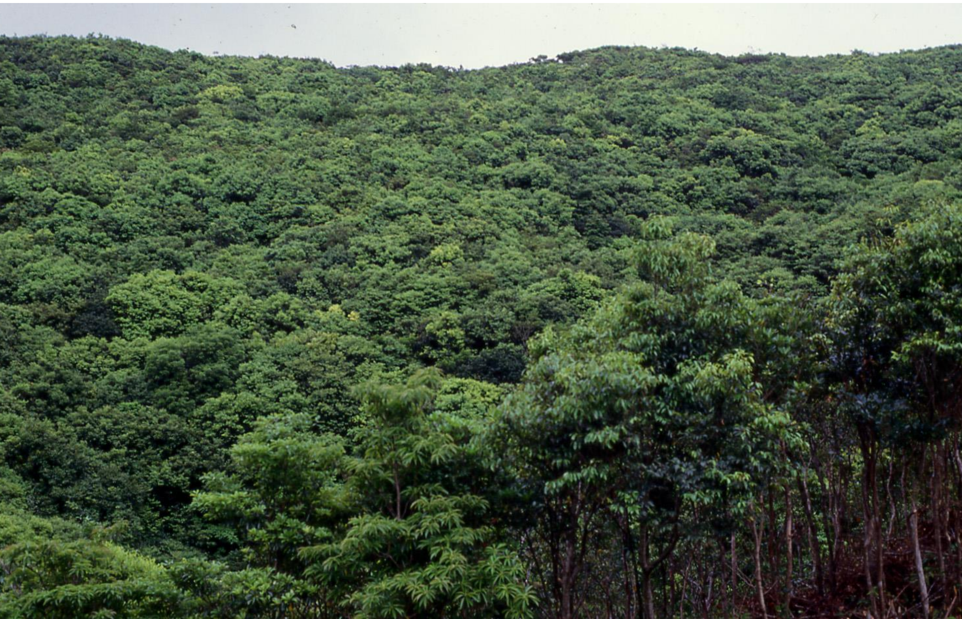
Subtropical forest in Okinawa