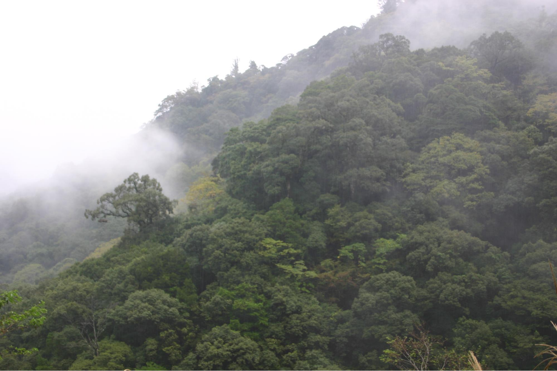
Evergreen forest in Miyazaki