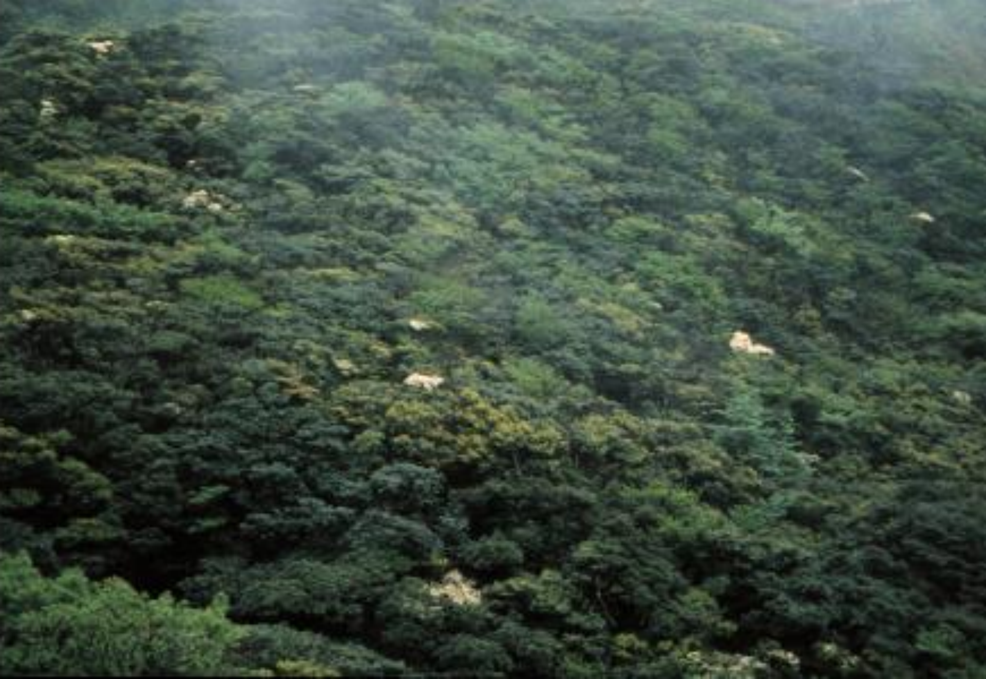
Evergreen forest in Izu