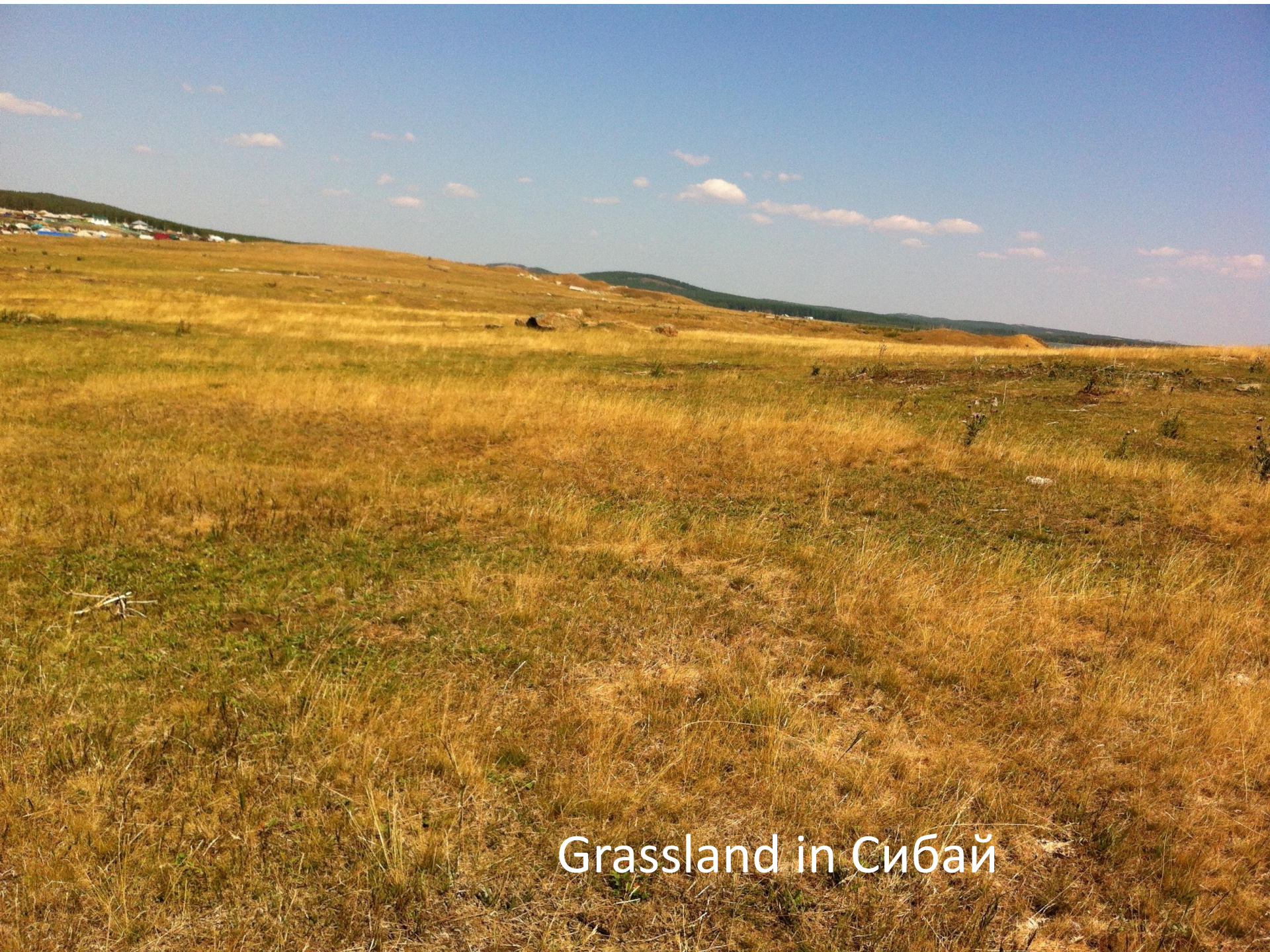
Grassland in Сибай